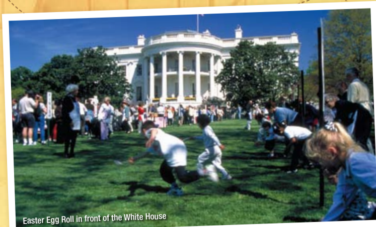
Easter Egg Roll in front of the White House

Walk south on Wisconsin Avenue to the Georgetown Waterfront.