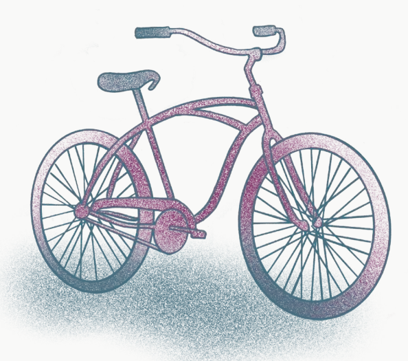
Go green and reduce noise pollution when you use DC's affordable bikeshare program, Capital Bikeshare.