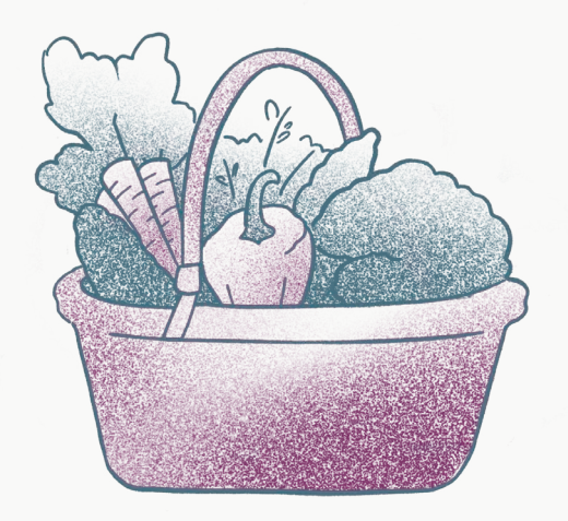
Enjoy fresh, seasonal and locally sourced products at more than 50 distinct farmers markets in the DC region.